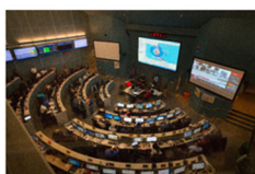
Palm Beach County Public Safety Department Division of Emergency Management

20 South Military Trail West Palm Beach, FL 33415 561-712-6400