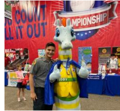
Buddy the Seahorse at the South Florida Fair

405 Pike Road West Palm Beach, FL 33411 561-616-7068 www.pbcgov.org/dpc astewart@pbcgov.org