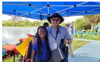
Access Life event providing life jackets to special needs boaters