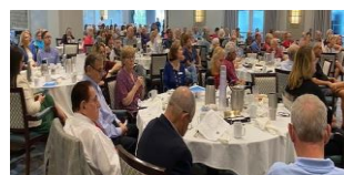
Adult presentation for 55+ HOA representatives from West Boynton area