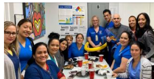
Adult presentation at Soma Pediatrics in Lake Worth